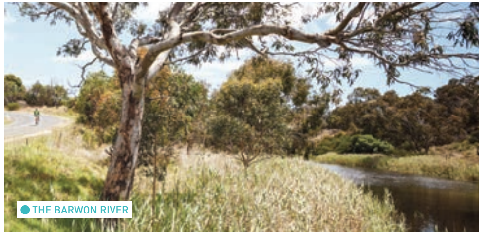
● THE BARWON RIVER