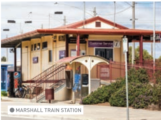
● MARSHALL TRAIN STATION