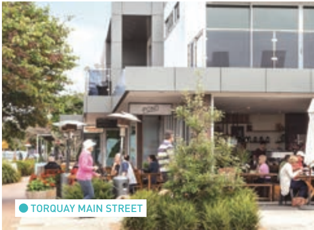
● TORQUAY MAIN STREET