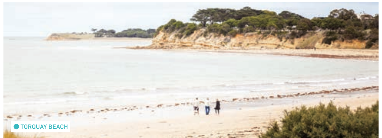
● TORQUAY BEACH